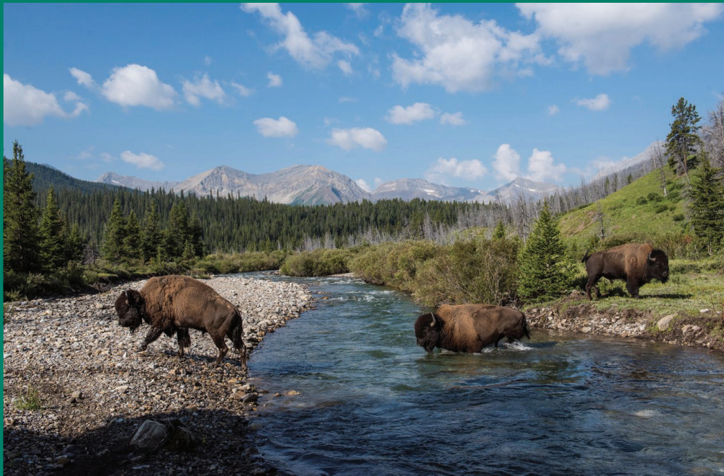
Bison on Stoney-Nakoda lands

Since time immemorial the Îyârhe Nakoda People lived in harmony with the Buffalo. The Buffalo is a great symbol and a great being to the Îyârhe People because it provided all the necessities of life. The Buffalo provided food, clothing, shelter, tools, supplies and hunting implements.