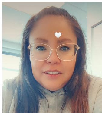
TYSA EAR Diploma in Upgrading, Bow Valley College WHIM Scholarship

I extend my sincerest thanks to the scholarship committee and Durum Capital Inc. for this incredible opportunity.