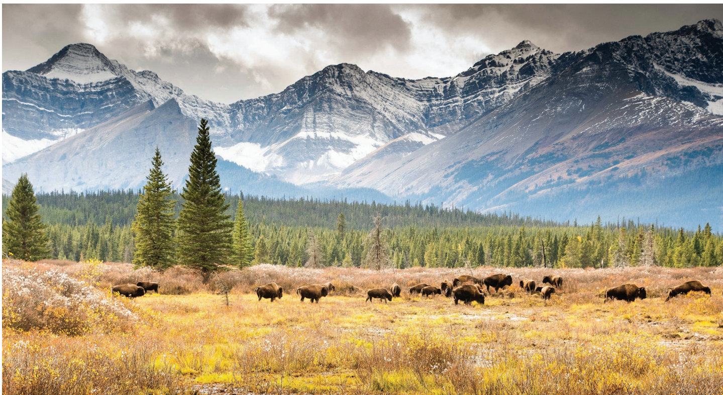
Bison on Stoney-Nakoda lands